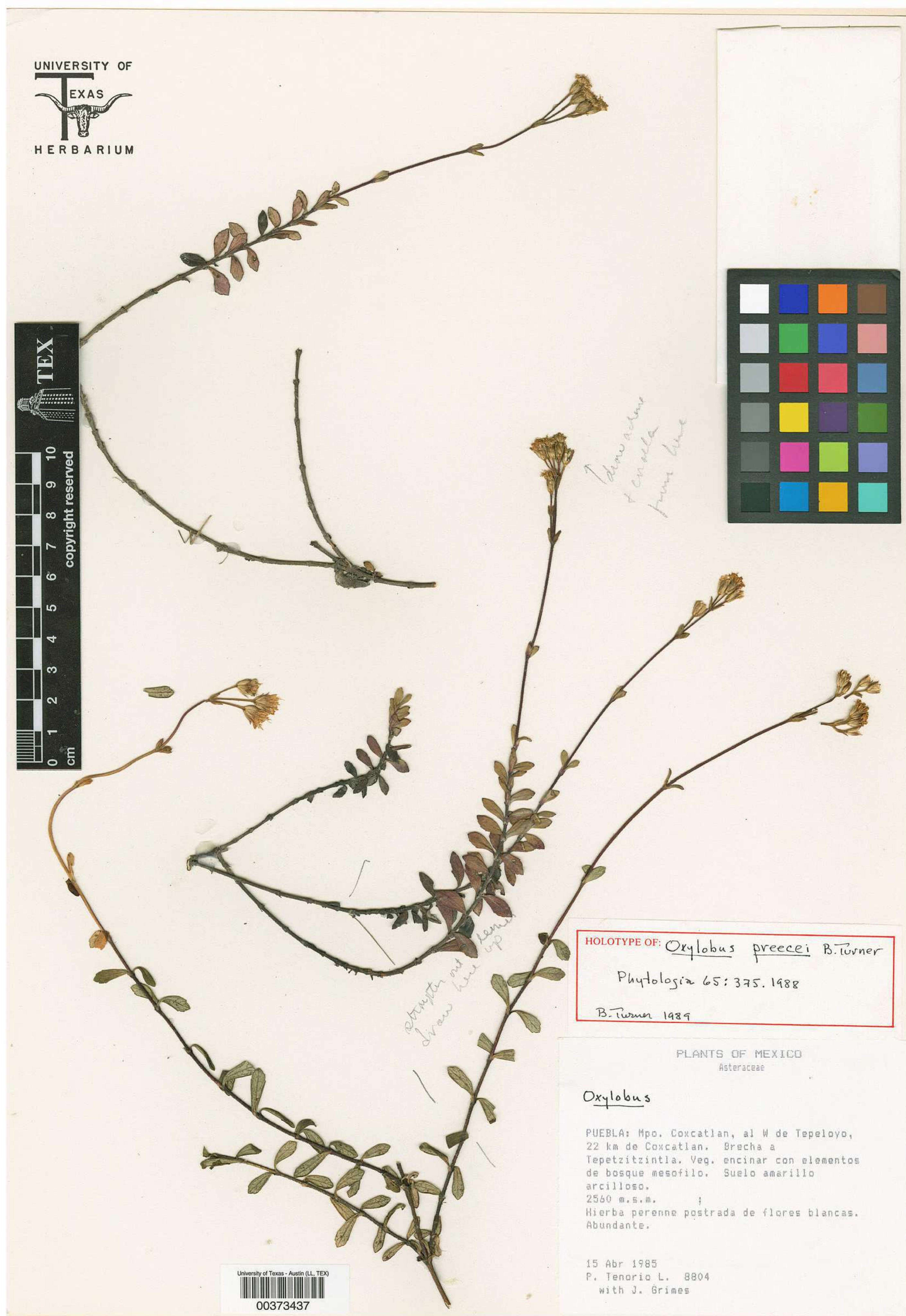
Figure 1. Holotype of Oxylobus preecei (TEX).